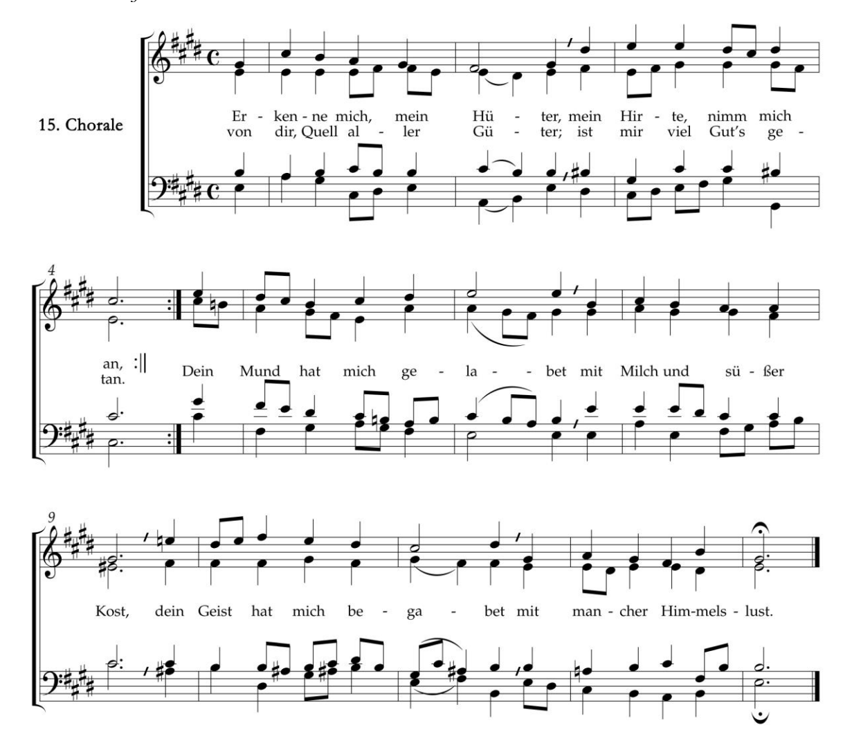
Please be seated.