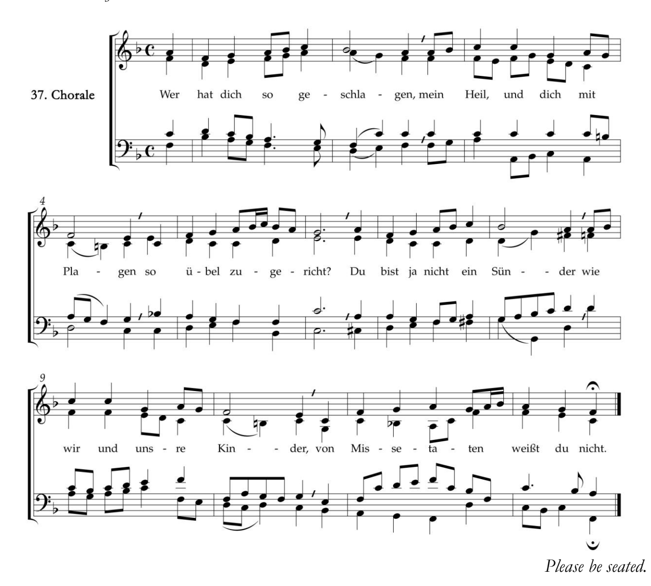
Please stand and join us as directed.