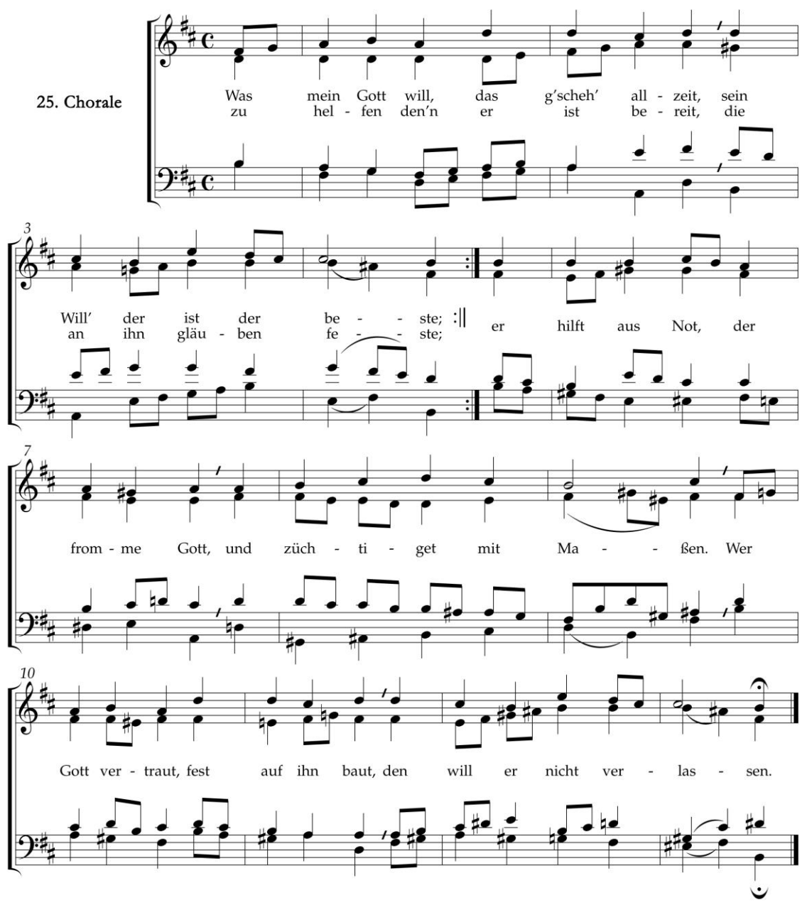
Please be seated.