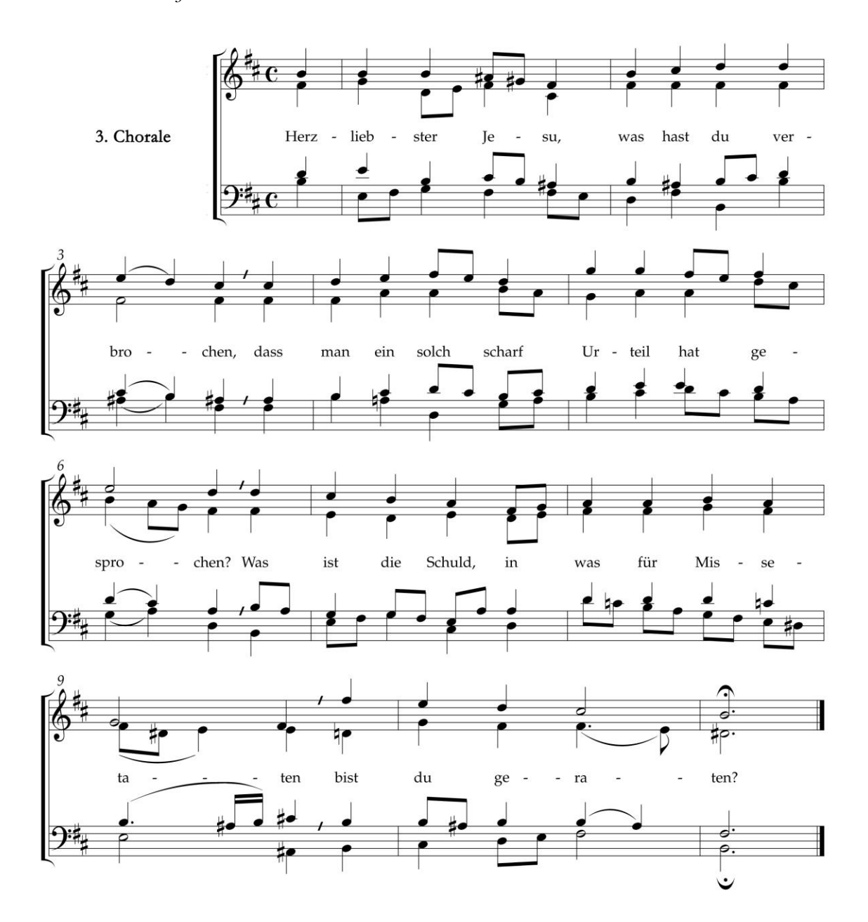
Please be seated.